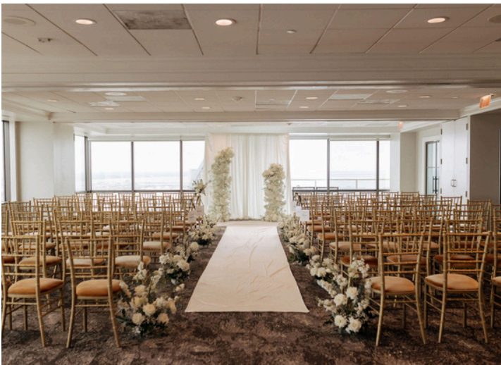
Channel View Room - Ceremony