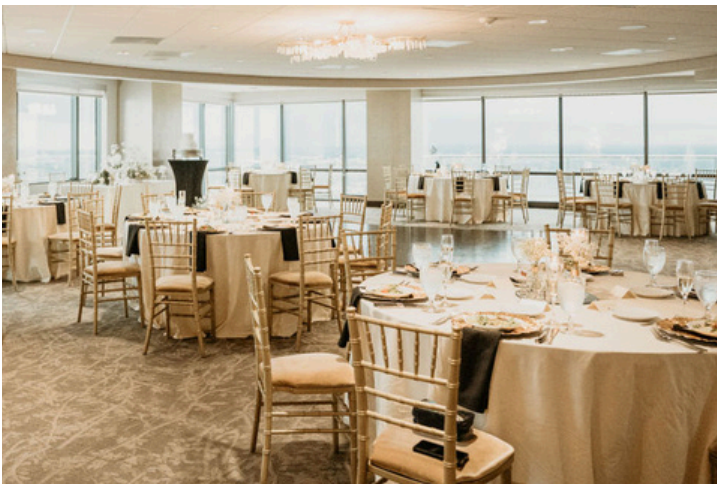
Canopy Ballroom - Reception