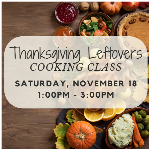
November- Cooking Class