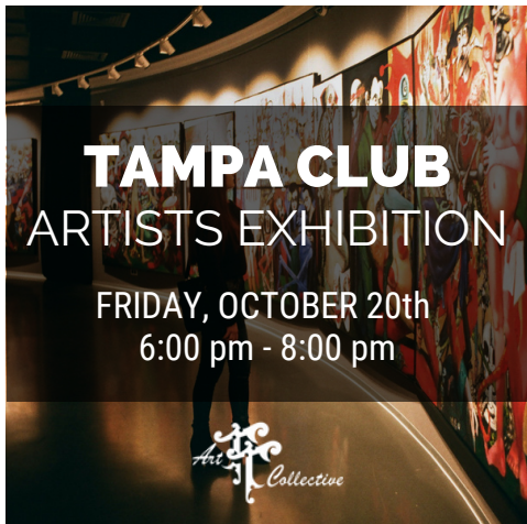
October- Artist Exhibition