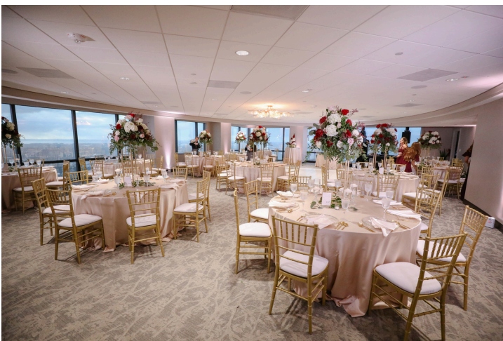
Canopy Ballroom - Reception