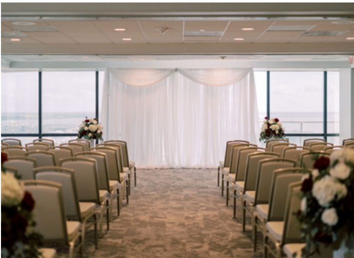
Channel View Room - Ceremony